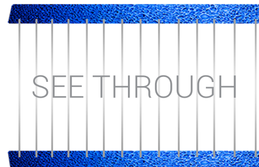
View from center