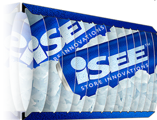
View from left angle