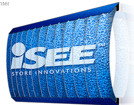
View from right angle

Questions? We have answers. (888) 417-2457 ext. 515 info@iseeinnovation.com