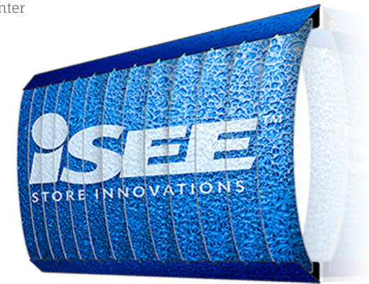
View from right angle

Questions? We have answers. (888) 417-2457 ext. 515 info@iseeinnovation.com