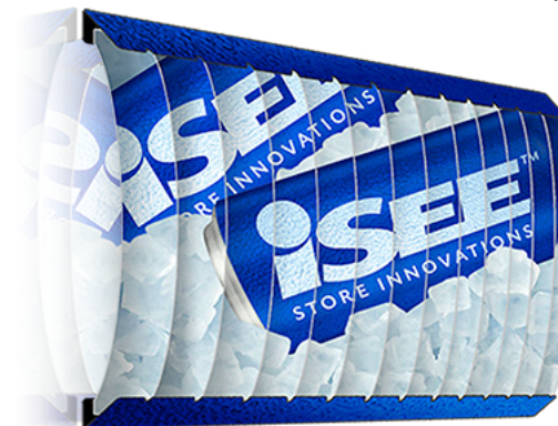
View from left angle